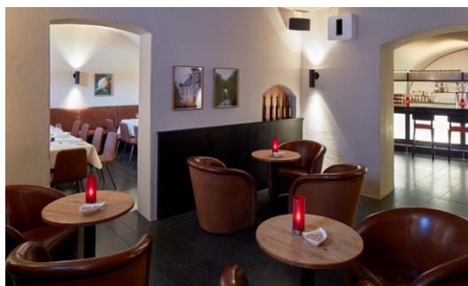
Club room Anteroom club room with Cotta-Bar